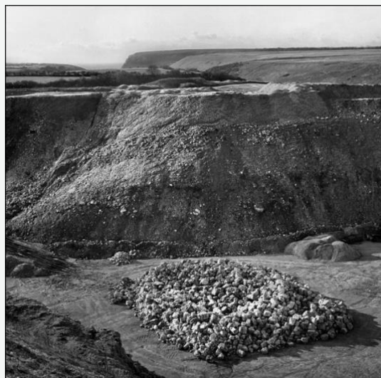
Gabion/cage stone and Rock Armour/ Sea Defences