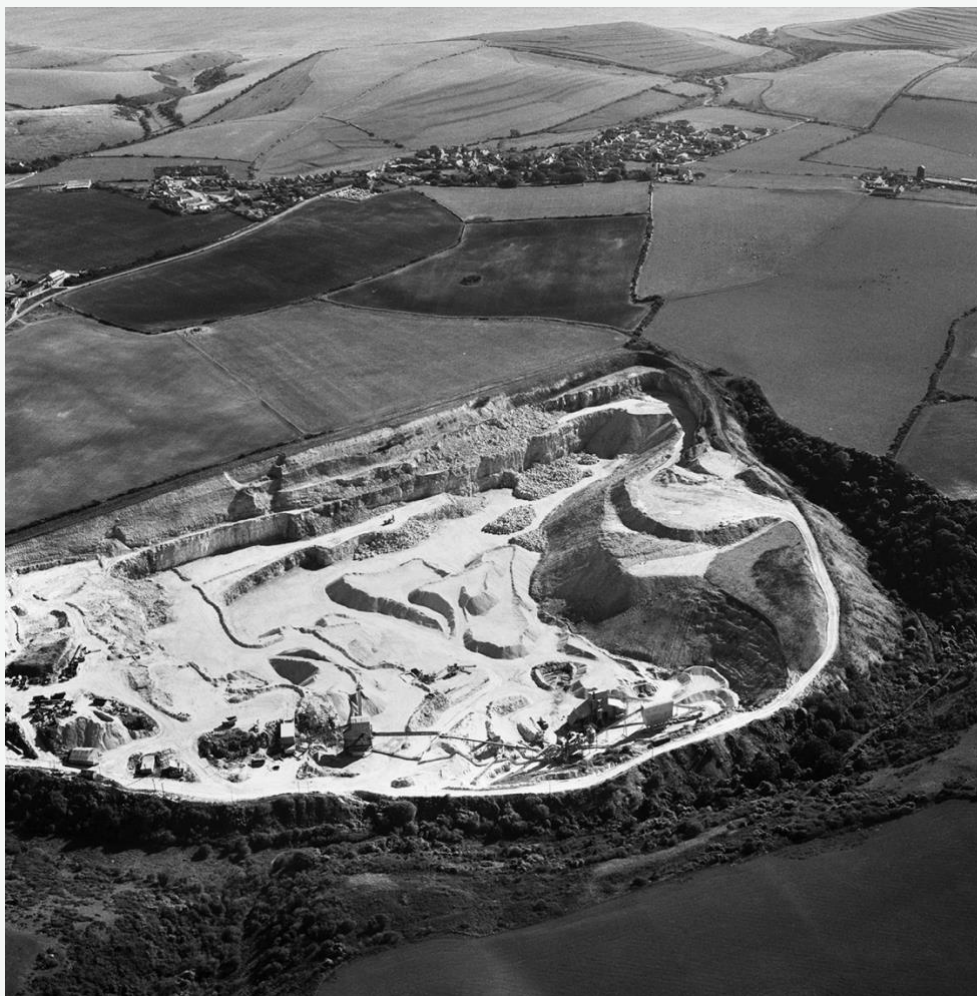
1992 Swanworth, a quarry on a different scale, using explosives.