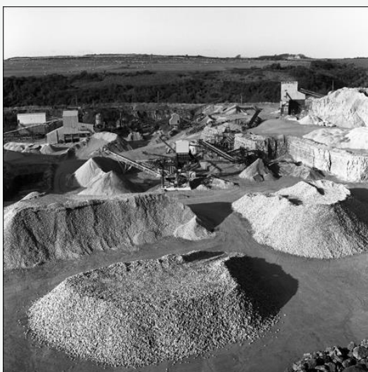
Crushed stone - 3mm to 40mm